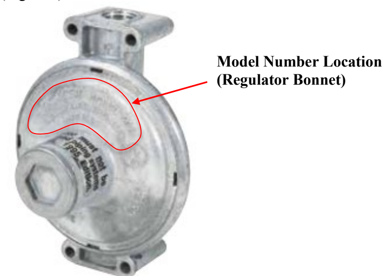
Figure 1: Regulator Bonnet with Model Location

Which Regulators Are Affected? The affected regulator models are numbers 302, 302P, 302V, 302VP, 302V9 & 302V9LS with manufacturing date codes of 09/22 through 02/23, including regulators marked with date codes of 21/22. The model number can be found on the bonnet of the regulator (see Figure 1) and the date code is marked on the regulator body as shown in (Figure 2).